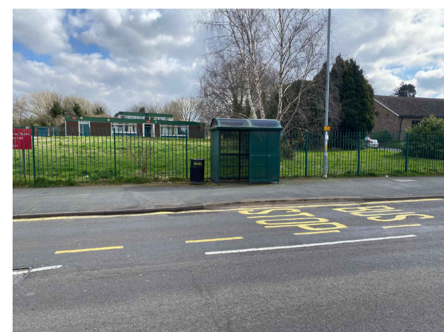
16: View from North Road