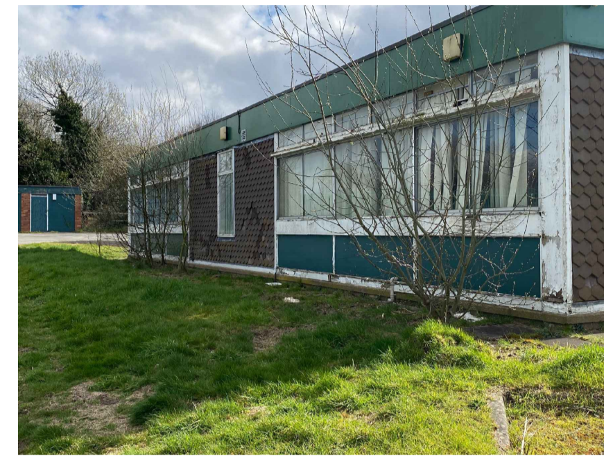
7: Main Building