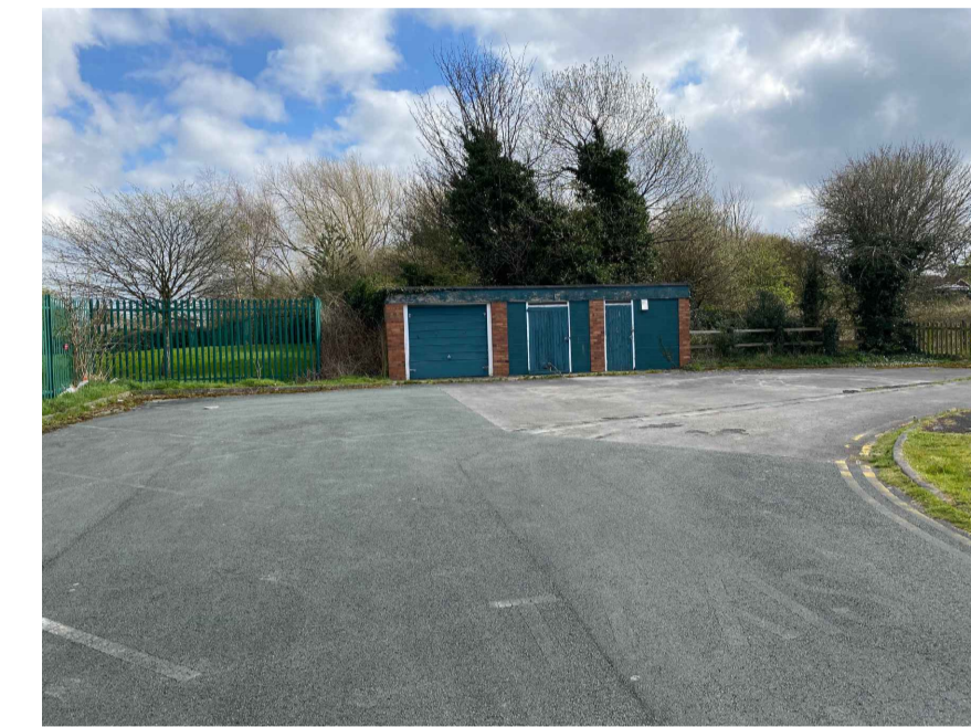
8: Garage & Outbuildings