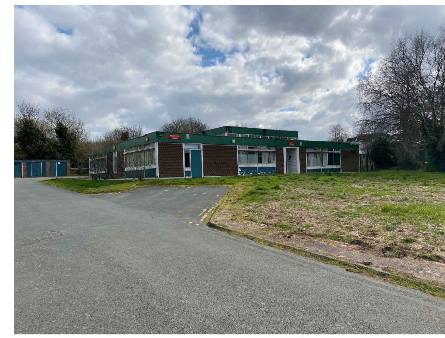
4: Main Building