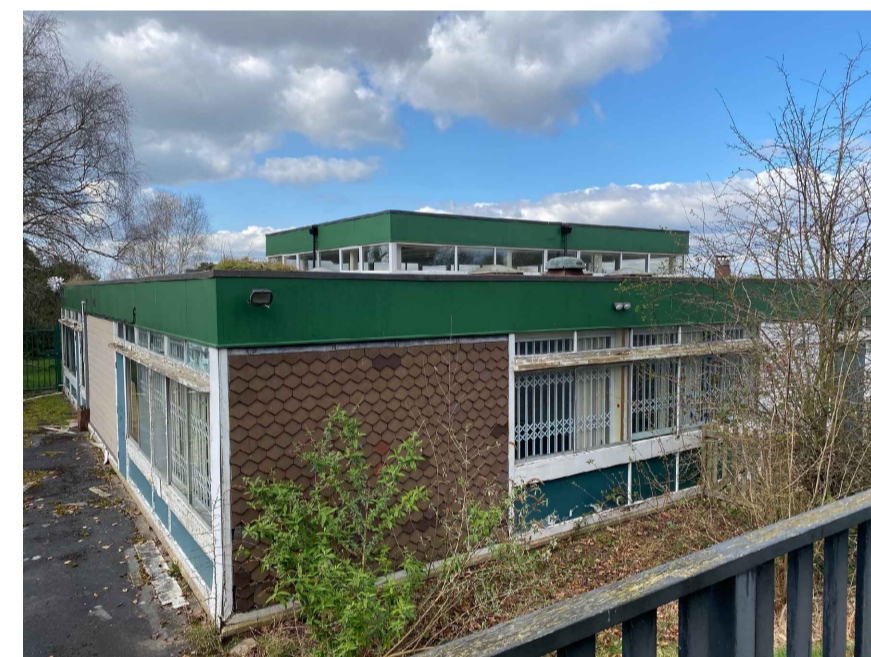
10: Main Building