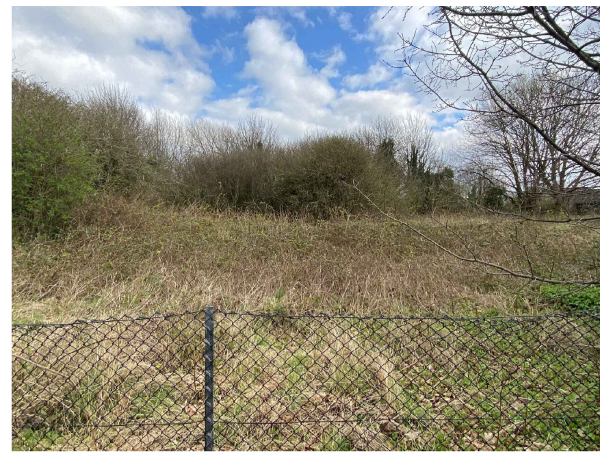
2: Wooded Area