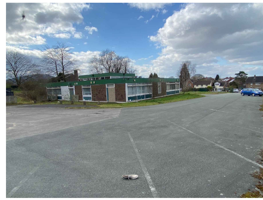
3: Main Building