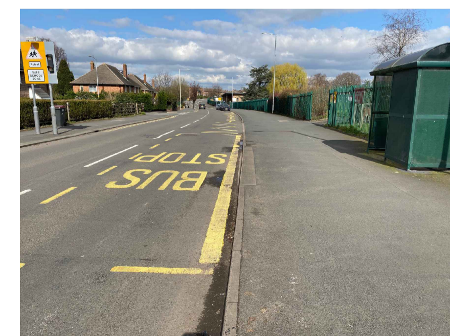
17: North Road