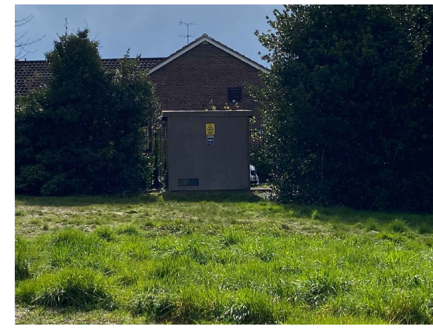
5: Electric Substation