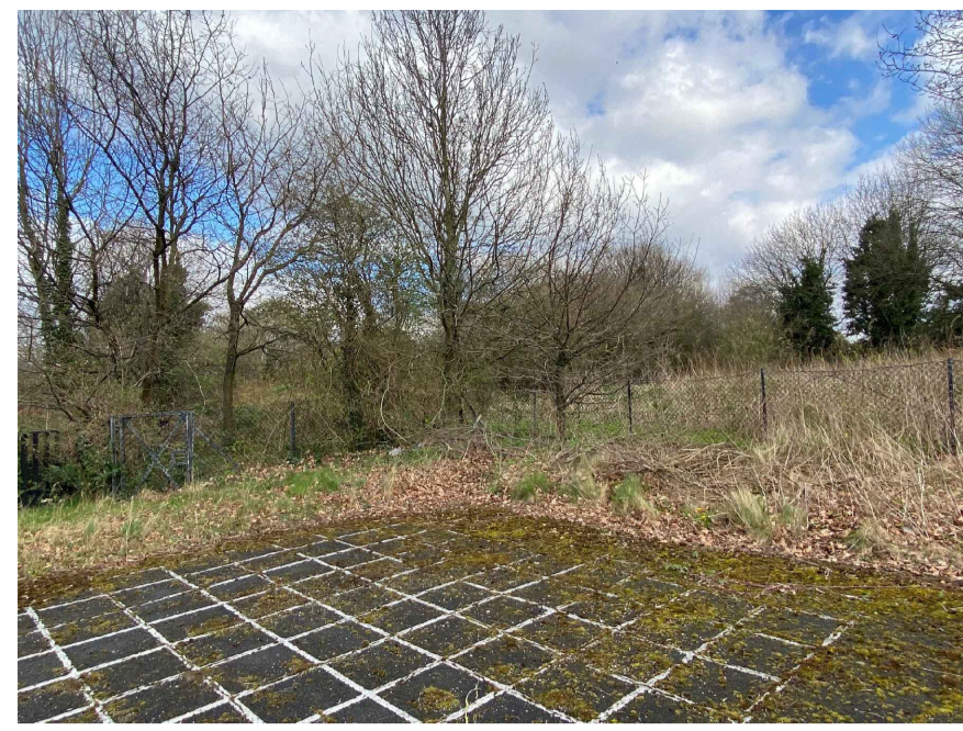
1: Rear Playground