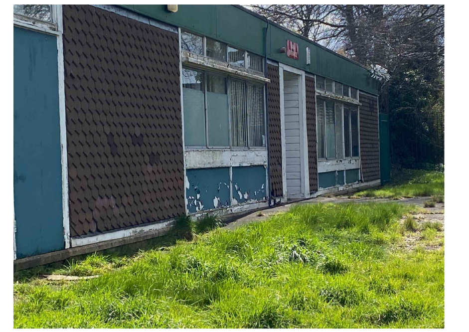
6: Main Building