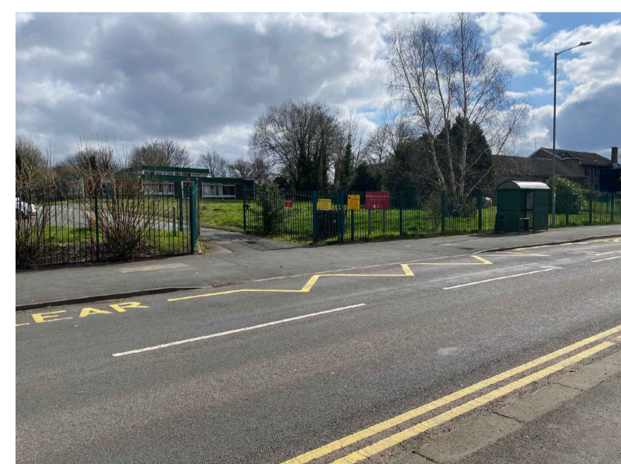
15: Site entrance