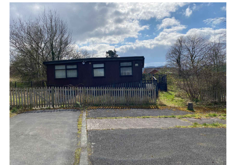
9: Demountable Unit